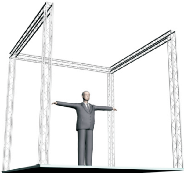
EXHIBIT AND DISPLAY TRUSS.COM

TEL: 905-509-0331 FAX: 905-509-0476 info@exhibitanddisplaytruss.com